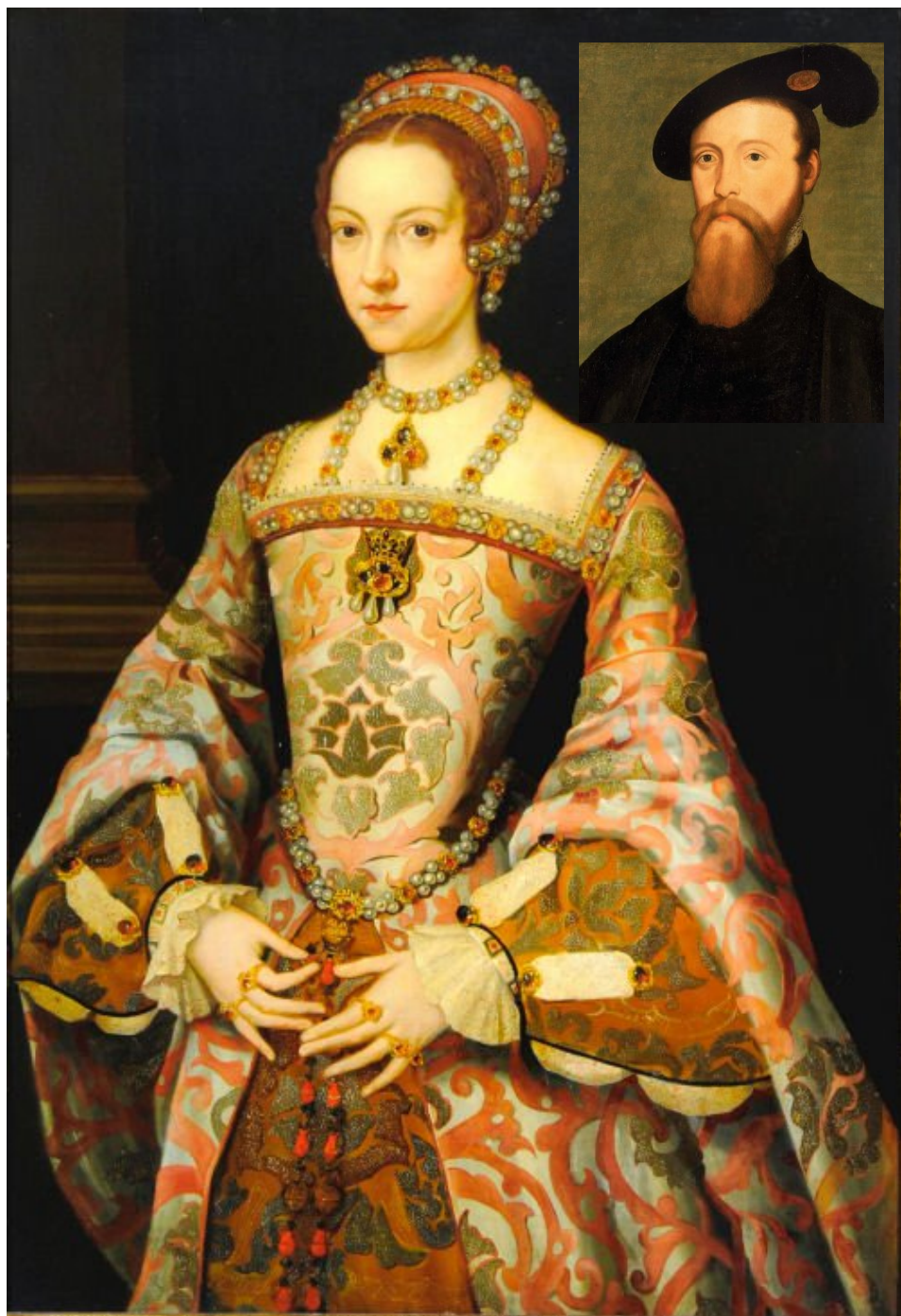
Catherine Parr and Thomas Seymour