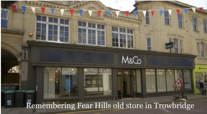
Remembering Fear Hills old store in Trowbridge