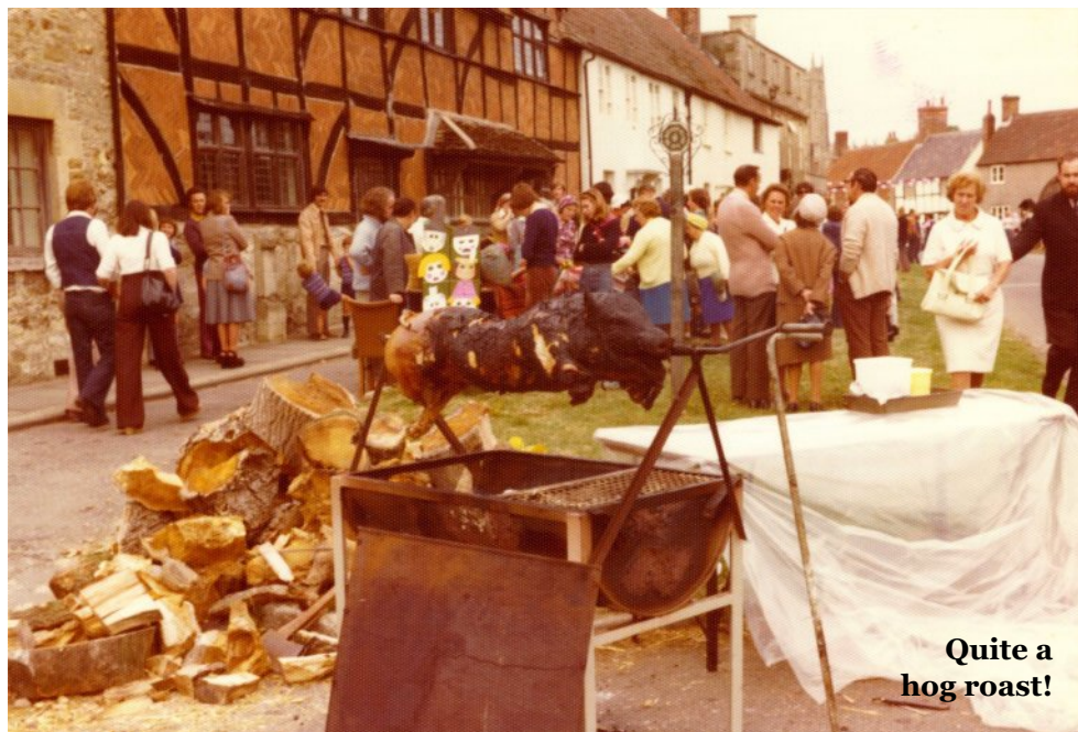
Quite a hog roast!