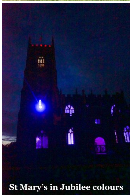
St Mary's in Jubilee colours