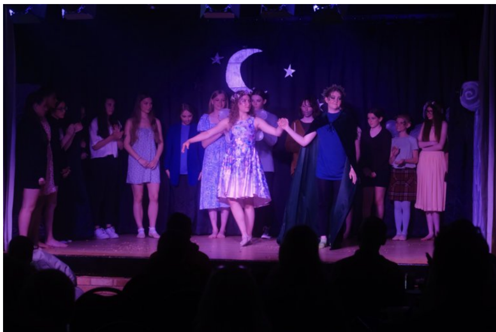
Guides and Rangers performing their Jubilee show in the Village Hall.