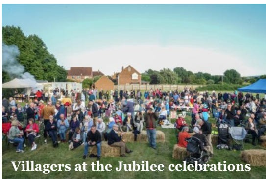
Villagers at the Jubilee celebrations