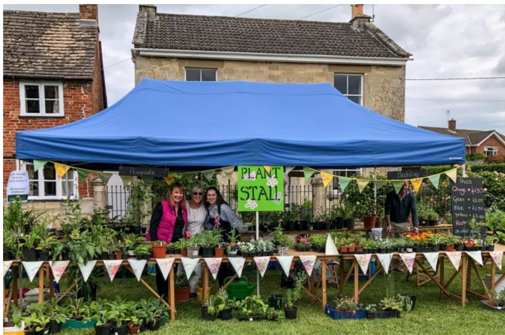
Open Gardens, plant stall and the queue to collect maps