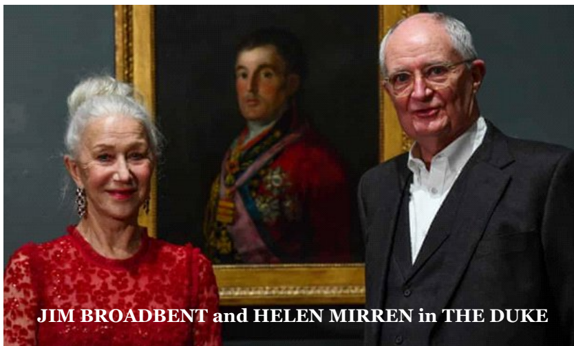
JIM BROADBENT and HELEN MIRREN in THE DUKE