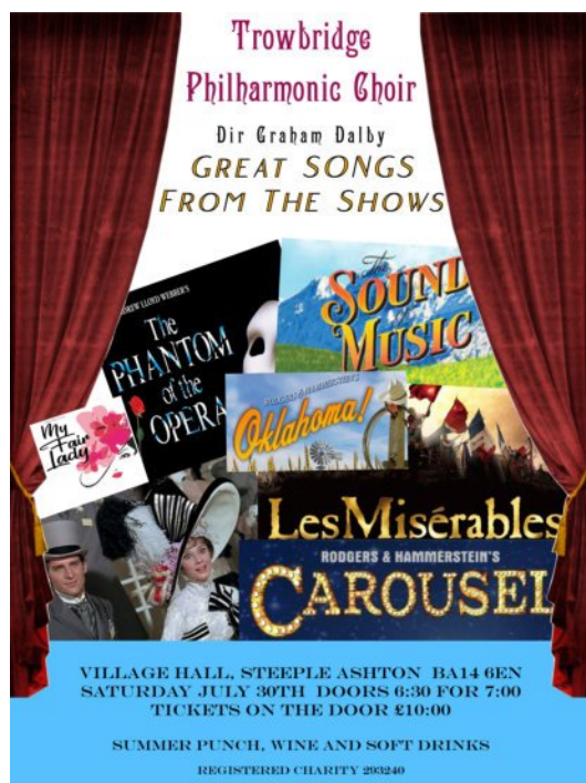
Trowbridge Phil Concert - Village Hall, Saturday 30th July, 7pm