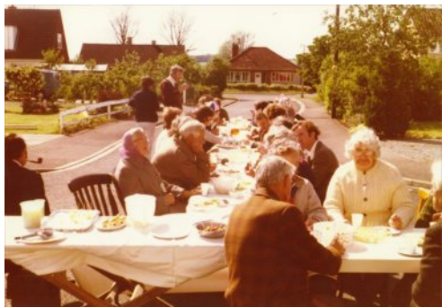
Acre Close Street Party, Tues 7 June 1977