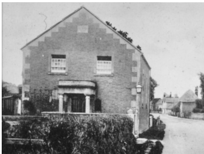
Methodist Church, early 20th century

By 1854 the Primitive Methodists had managed to raise a large mortgage, and a red-brick Methodist Church, complete with adjoining cottage, was built at the northern end of the village centre – where it is still in use today.