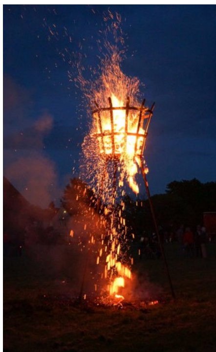
The Beacon in Steeple Ashton